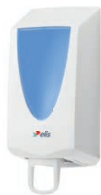
Foam Soap Dispenser (Manual) 800ml (Non touch option 800ml)