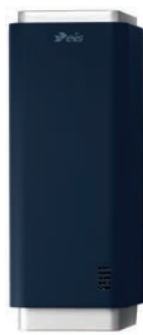
Non touch Soap Dispenser 500ml