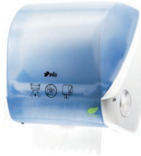
Paper Roll Dispenser Non Touch