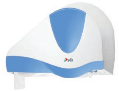
Jumbo with Reserve