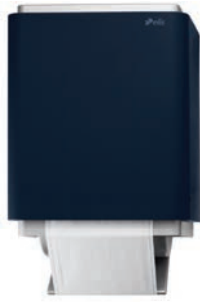
Retractable Cotton Towel Dispenser