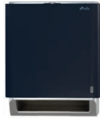
Non Touch Paper Towel Dispenser Singles Sheets