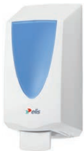
Hand Soap Dispenser (Manual) 650ml – 1,000ml