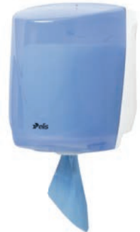
Centerfeed Paper Dispenser