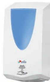
Non Touch Hand Soap Dispenser 650ml – 1,000ml