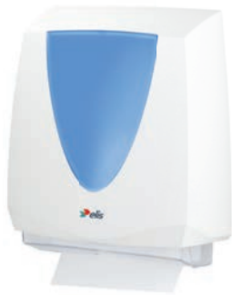
Folder Paper Dispenser