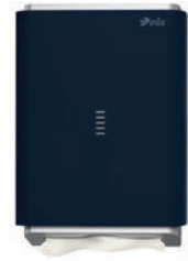
Paper Towel Dispenser Z fold Paper Towels