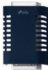
Passive Air Freshener