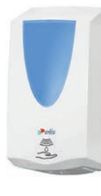
Non Touch Hand Sanitiser Dispenser 650ml – 1,000ml