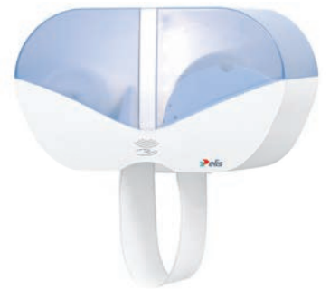
HYCARE Unit Also available in Black