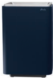
Refuse Bin 20 litre / 50 litre